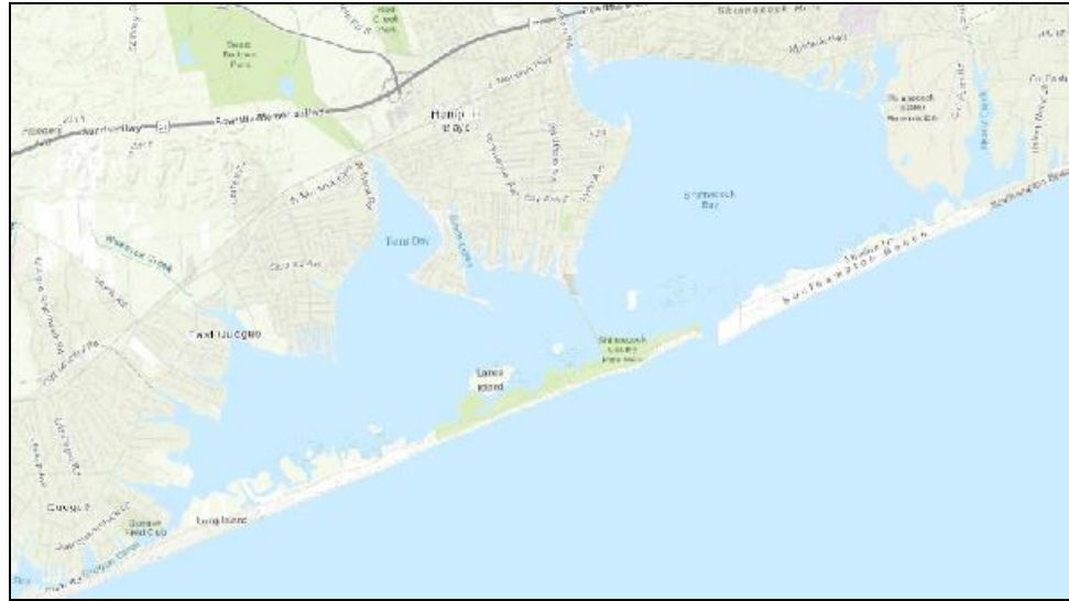
Figure 2 Shinnecock Bay