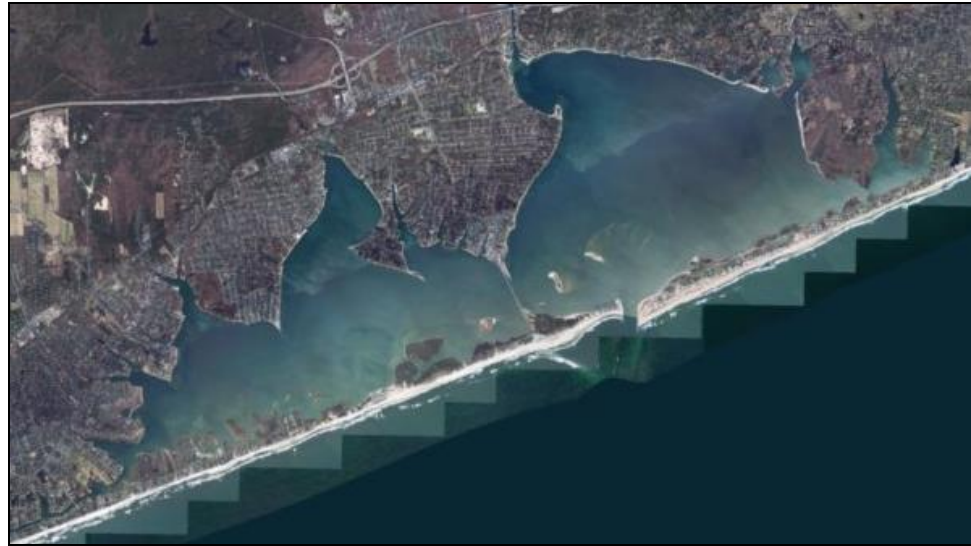
Figure 1 Shinnecock Bay